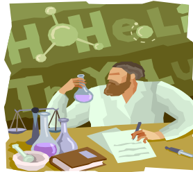
Syantist ki ap fè eksperyans

Yo repond. Yo ale, yo voye savon ak dlo cho sou mons la. Godzilla si tèlman sezi li kouri rantre nan twou kote li te soti a.